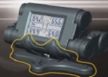
● 360 adjustable bracket