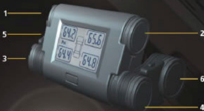
● ID module default installation position